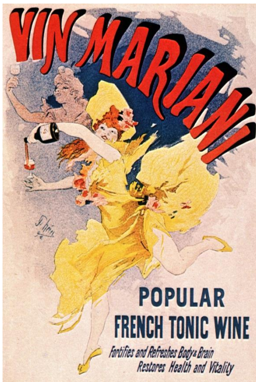
Advertisement for Vin Mariani, a tonic containing red wine and cocaine, from the “Pick Your Poisons” exhibit.

Mind-altering drugs have been used throughout the history of America. While some remain socially acceptable, such as alcohol, others, like heroin and cocaine, are now outlawed because of their toxic, and intoxicating, characteristics. These classifications have shifted at different times in history, and they will continue to change.